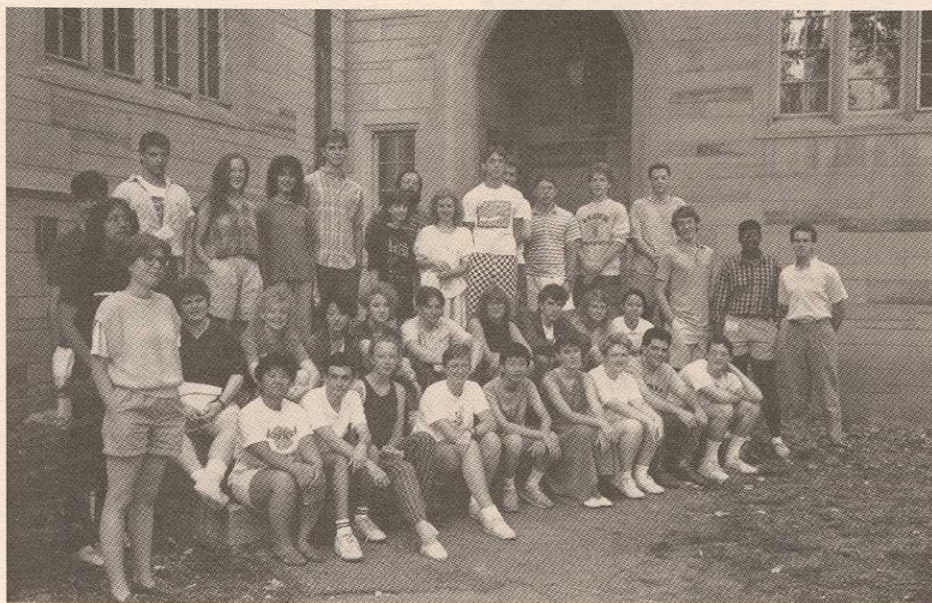
THIRTY-SIX STUDENTS MADE #9 THE BEST YET.