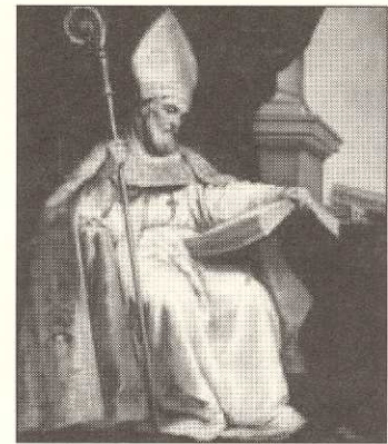
Isidore of Seville, patron saint of computers, computer users, and the Internet, relaxes offline.